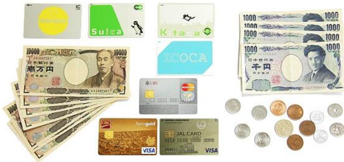
Cash, credit cards and IC cards

The Japanese currency is the yen (円). One yen corresponds to 100 sen. However, sen are usually not used in everyday life anymore, except in stock market prices. Bills come in 1,000 yen, 2,000 yen (very rare), 5,000 yen and 10,000 yen denominations. Coins come in 1 yen, 5 yen, 10 yen, 50 yen, 100 yen and 500 yen denominations.