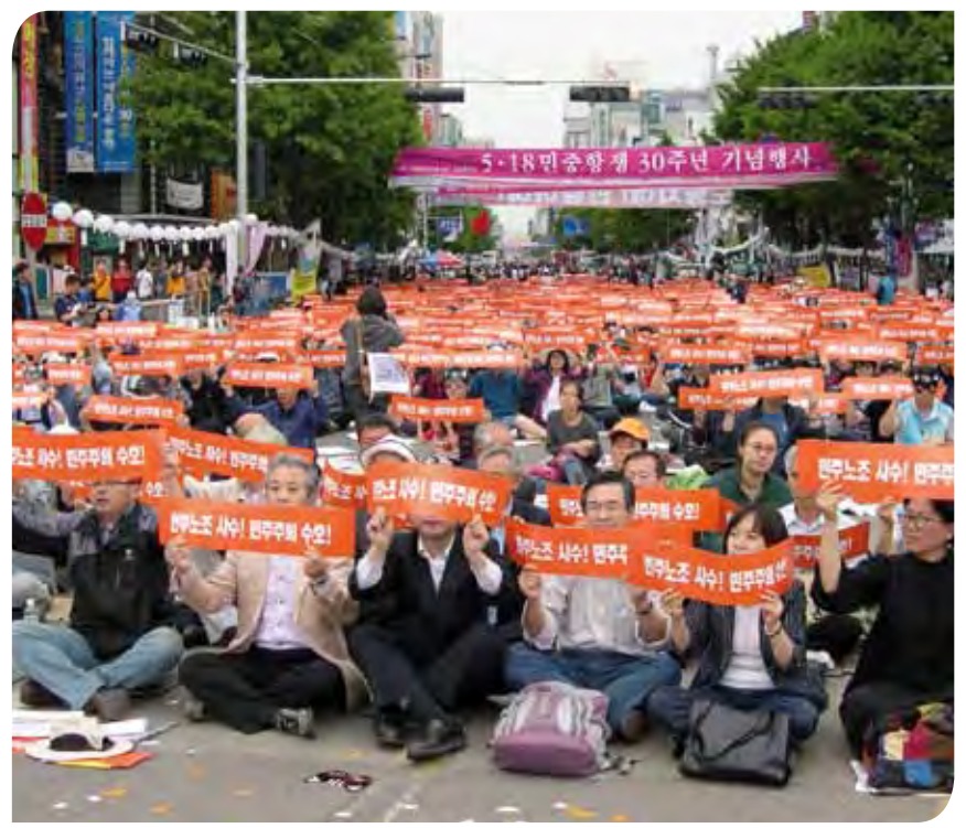
"Defend Democratic Trade Unions! Protect Democracy in Korea!"

The fall-out from the global economic crisis provided the 'perfect storm' for anti-trade union actions.