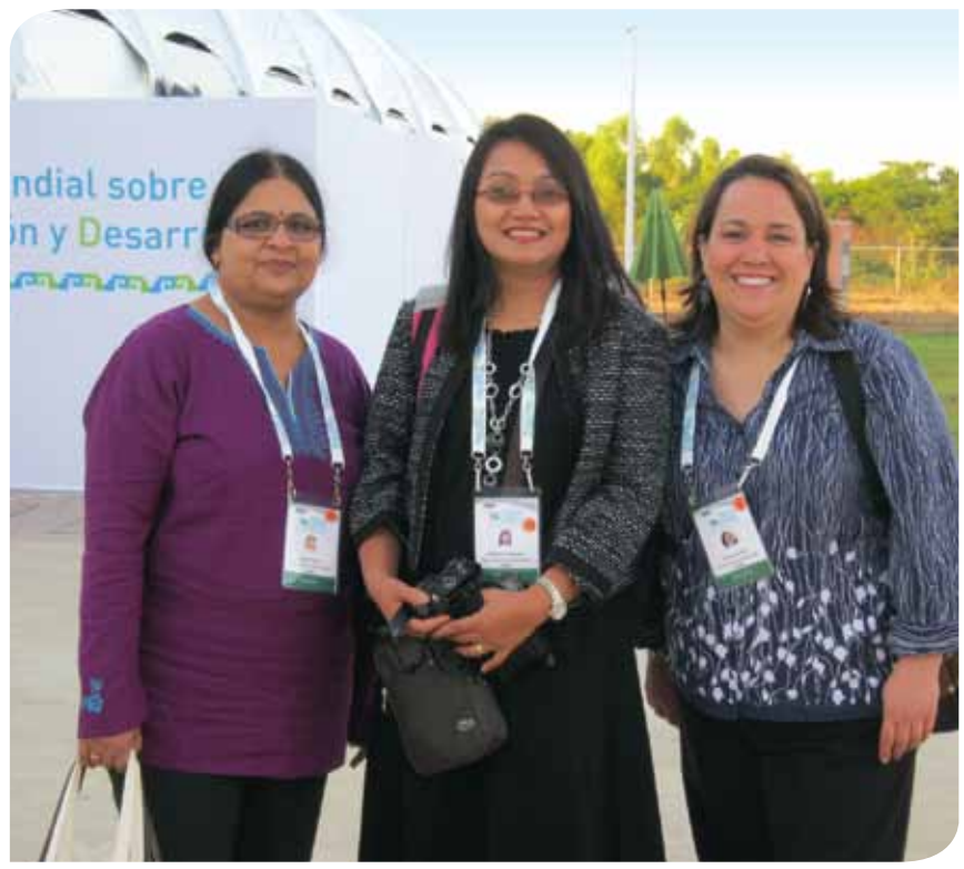
Global Forum on Migration and Development Civil Society Days (CSD), Mexico

PSI's policy and programme advisory group convened to refine the project's work plan. Given that project resources