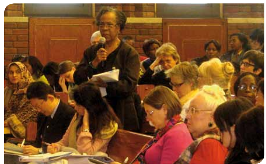
PSI trade union delegates participate in daily briefings at 2010 UN Commission of the Status of Women forum, New York

The committee on decent work for domestic workers is particularly