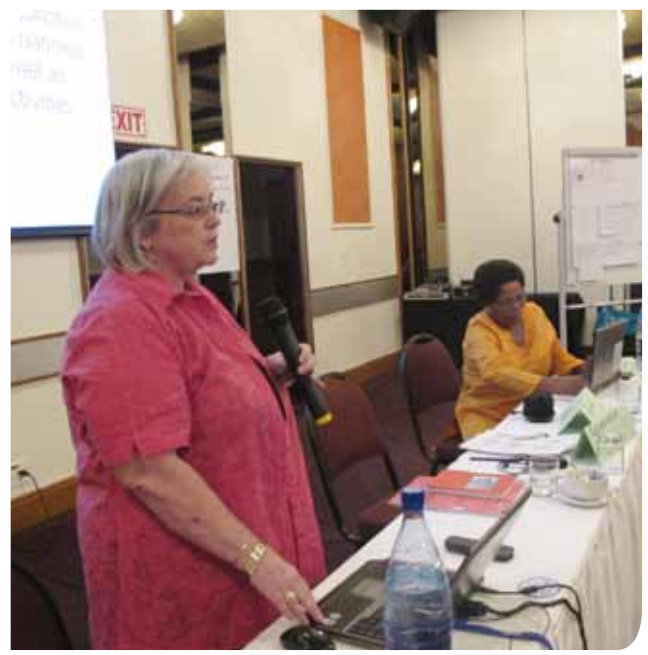
South Africa project planning workshops

The programme also conducted a study into privatisation and precarious work, and the results were used for