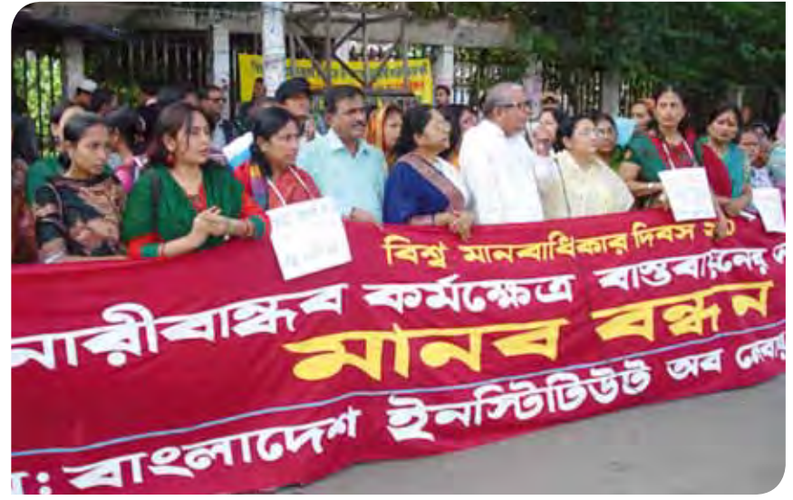
Bangladesh Human Rights Day

The Indonesian PLN Union has been campaigning against a new law on electricity privatisation, and is now pursuing this further. \diamond