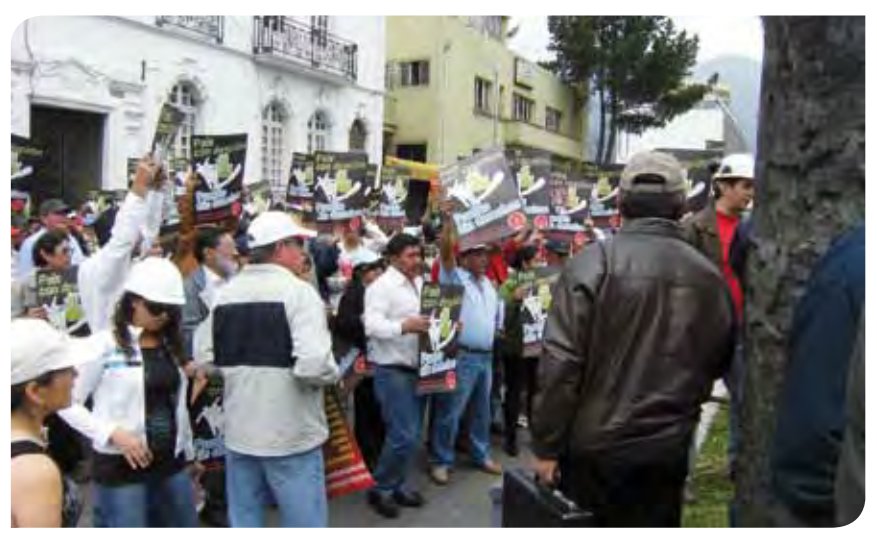
PSI affiliate municipal and provincial government workers protest elimination of their trade union rights in Ecuador

protests throughout the country, which erupted into violence when police officers and soldiers took over Quito airport, shutting it down. PSI affiliates FETRALME and FENOCOPRE (representing municipal and provincial government workers) are part of the National Coordination of Public Sector Unions, a coalition of unions working to reverse these measures, including through use of the International Labour Organization's supervisory mechanisms. \circledast