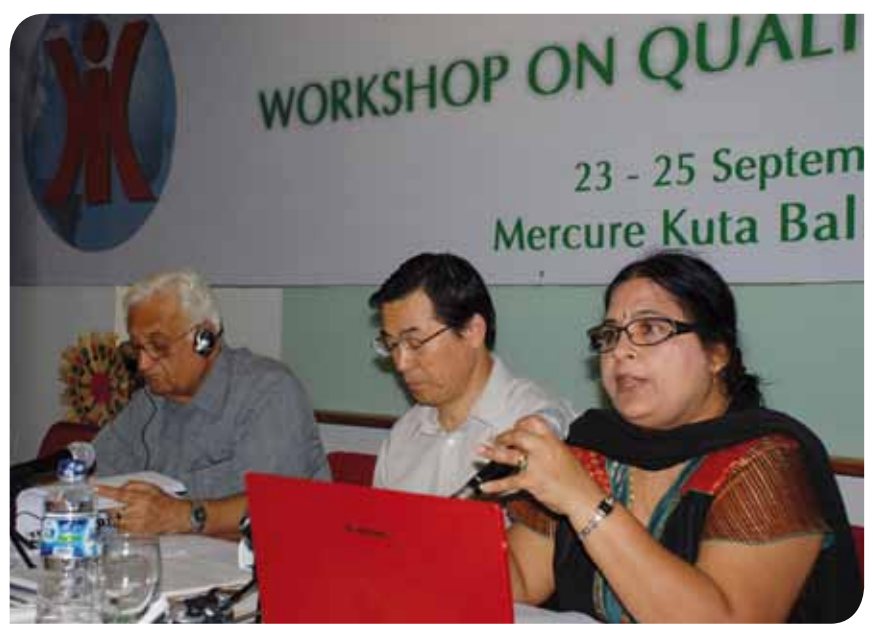
Workshop on Quality Public Services

A 19-member delegation from the region, together with representatives from sister global union federations BWI and UNI, attended the Asian Development Bank 43rd Annual Governors Meeting in Tashkent, Uzbekistan. PSI and the GUFs held a forum on 'Workers and unions in