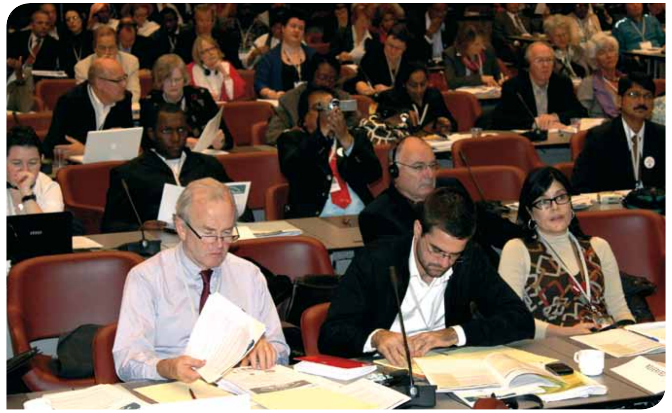
Quality Public Services-Action Now! conference