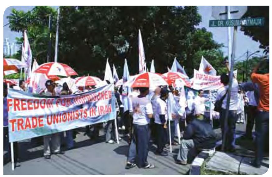
PSI with ITF Indonesia affiliates in solidarity action at Iranian Embassy, Jakarta, 9 July 2010

Other campaigns have been organised in India (AP Municipal Contract Workers Union) and Japan. And unions in Malaysia conducted a workshop to review the Industrial Relations Act, where public sector unions do not have union recognition or access to collective bargaining.