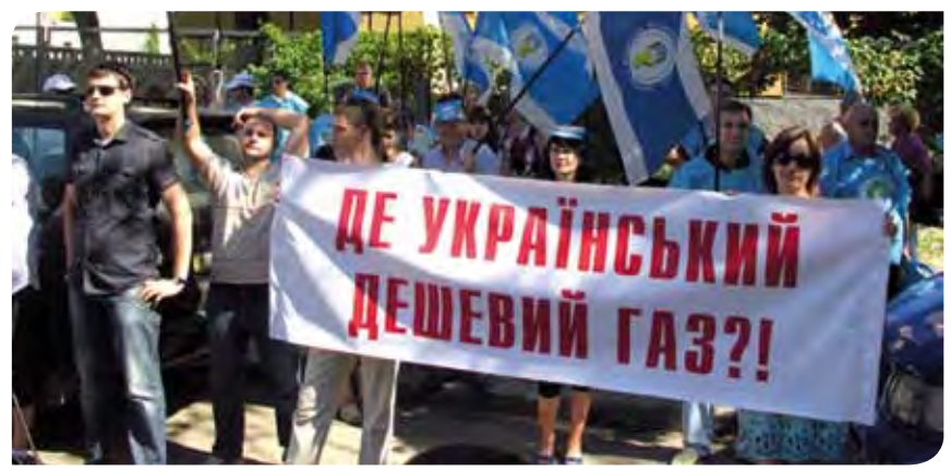
Picket by Health Workers Union and State Employees Union of Ukraine on 16 July 2010

At the European level, EPSU contributed to the consultation on the review of the Working Time Directive. The EPSU and the Employers' Platform in local and regional government agreed to a joint declaration calling on the European Council to take a longterm perspective when coordinating its responses to the ongoing economic crisis and to provide for public investment to mitigate the effect of the crisis. The EPSU also formally launched the social dialogue process for central government administrations,