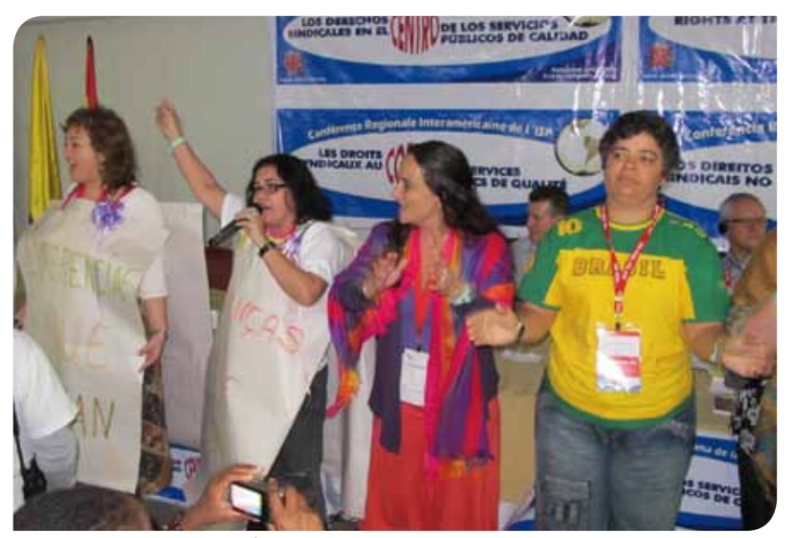
Inter-American Regional Conference delegates

The main event of the year was the successful Inter-American Regional Conference (IAMRECON), held in September in Cartagena de Indias,