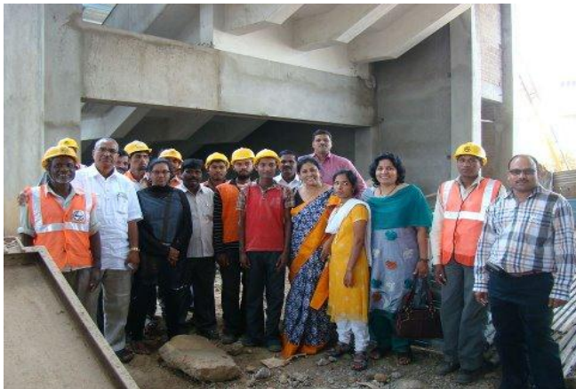
Global union federation representatives, including from PSI affiliates, visited worksites of the Bangalore Metro Rail Corporation on 5 July 2012.