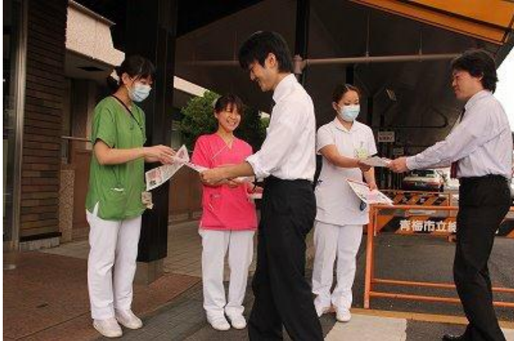
Japan: 3 million have signed a petition demanding action to improve working conditions, reduce turnover, and reduce a serious shortage of nurses. For more, click here .