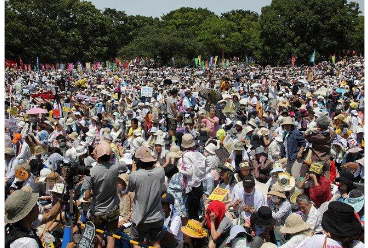
170,000 people from unions and civil society organisations protest nuclear power in Tokyo. For more, click here .