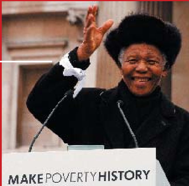
Nelson Mandela, at a London rally for debt relief, 3 February 2004.

“Recognise that the world is hungry for action, not words. Act with courage and vision.”